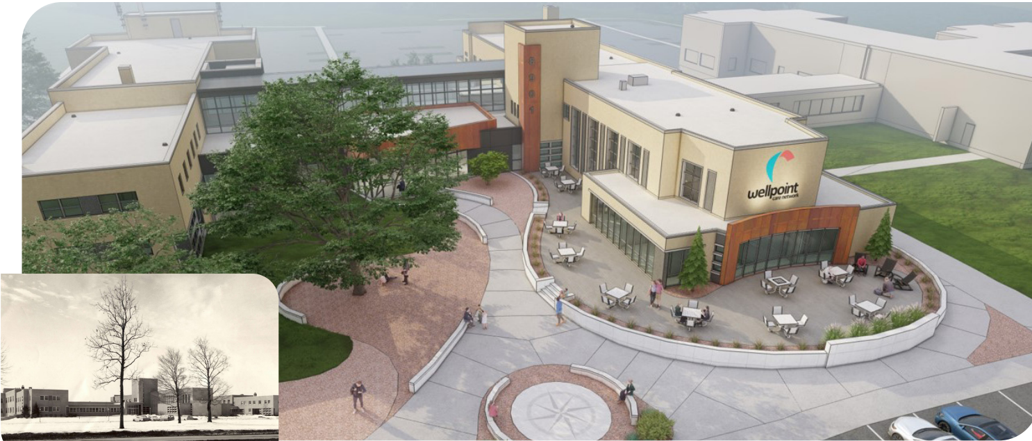
Inset: Capitol Drive campus, 1950s. Above: Architect's rendering of the Main Entrance of the Wellpoint redevelopment site.