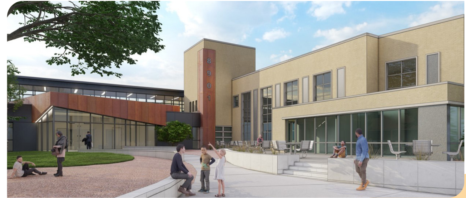
Above: A ground-level view of the more-accessible Main Entrance shows off gathering space and greenery.