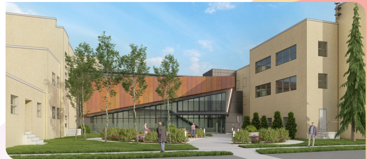
Below: The revamped Employee Entrance (accessible from 88th Street) faces the current parking lot.